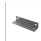
90° Bracket kit LKITA00000000020