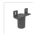
Pole mounting bracket LKITA00000000002