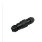
Fast connector IP 2 poles LKITA00000000017