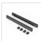
Modules assembly kit LKITA00000000005