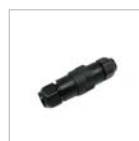
Fast connector IP 3 poles LKITA00000000003