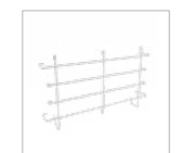
Grid kit IK10 protection LKITA00000000039

Lanzini indicates the luminous flux of the luminaire in the catalogs with a tolerance of ± 10% respect to the indicated value. The total W indicates the total power absorbed by the LED + power supply system that does not exceed 10% of the indicated value.