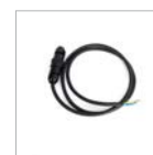
Cable with connector Ca. 2 m., Con 2 poles LKITA00000000040 Ca. 2 m., Con 3 poles LKITA00000000041