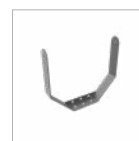
Bracket Kit Galvanised iron LKITA00000000043 Inox LKITA00000000044