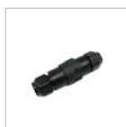
Fast connector IP 2 poles LKITA00000000017