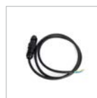
Cable with connector Ca. 2 m., Con 2 poles LKITA00000000040 Ca. 2 m., Con 3 poles LKITA00000000041