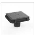
Pole connection A Max 4 x Q LKITA00000040001