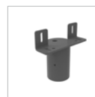
Pole mounting bracket LKITA00000000002

Lanzini indicates the luminous flux of the luminaire in the catalogs with a tolerance of ± 10% respect to the indicated value. The total W indicates the total power absorbed by the LED + power supply system that does not exceed 10% of the indicated value.