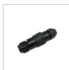
Fast connector IP 3 poles LKITA00000000003