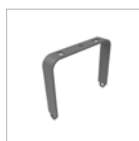
Ceiling Kit LKITA00000000060 Galvanised iron LKITA00000000061 Inox