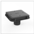
Pole connection A Max 4 x Q LKITA00000040001