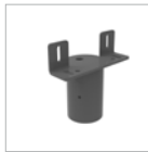
Pole mounting bracket LKITA00000000002