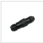
Fast connector IP 3 poles LKITA00000000003