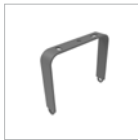
Ceiling Kit LKITA00000000060 Galvanised iron LKITA00000000061 Inox