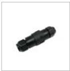
Fast connector IP 2 poles LKITA00000000017