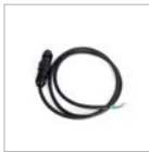
Cable with connector Ca. 2 m., Con 2 poles LKITA00000000040 Ca. 2 m., Con 3 poles LKITA00000000041